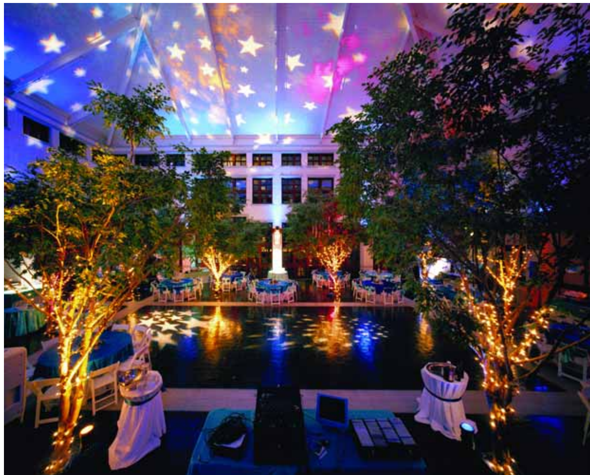
Cover photo: Blue Steel Pro Lighting