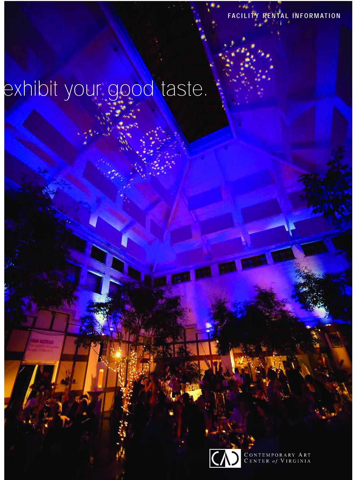
exhibit your good taste.